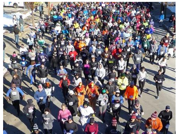
Guthrie Sayre Turkey Trot 2018 Starting Line

Proceeds from the 15 th Annual Guthrie Sayre Turkey Trot will benefit Guthrie’s Cancer Care Fund. The Cancer Care Fund provides financial relief to Guthrie cancer patients at all Guthrie Cancer Center facilities. Financial burdens can take a significant toll on our patients who should be focusing on healing and finishing their fight against cancer and Guthrie’s Cancer Care Fund is there to assist supporting expenses related to housing, transportation, and utilities.