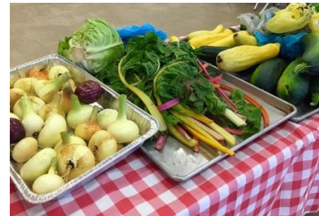
Guthrie Community Garden August 2018 Harvest

Proceeds from the 12 th annual Guthrie Sayre Turkey Trot will benefit the Guthrie Community Garden and the Food Farm Family Festival – both of which focus their efforts on education about and access to sustainable, nutritious food. The Guthrie Community Garden, now in its third season, is volunteer run and features 24 raised beds for growing fresh, seasonal vegetables that are distributed to local food bank locations. The Food Farm Family Festival, a free community event, promotes healthy living in a family-friendly, farmers' market environment.