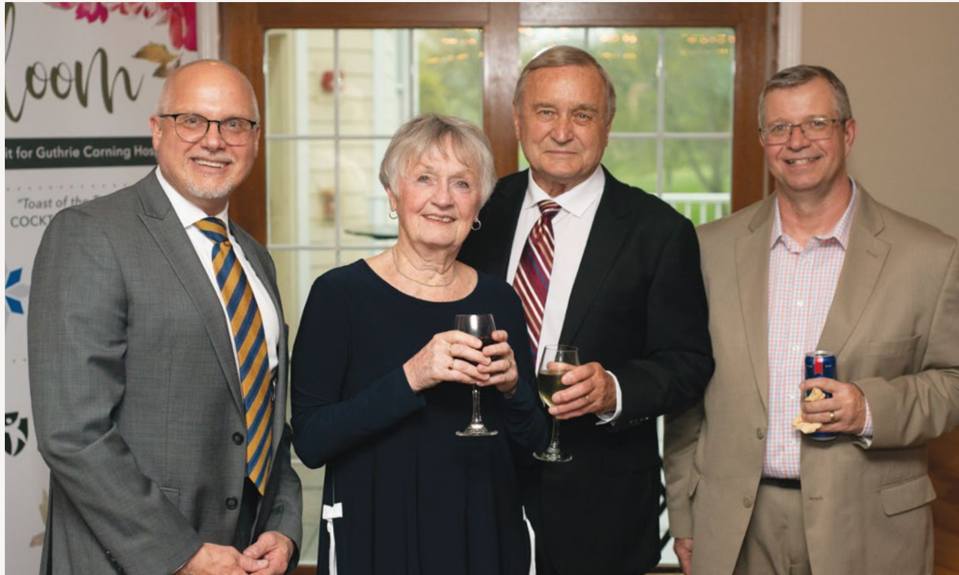
Attendees gather at “Bloom,” honoring a decade of care at Guthrie Corning Hospital.