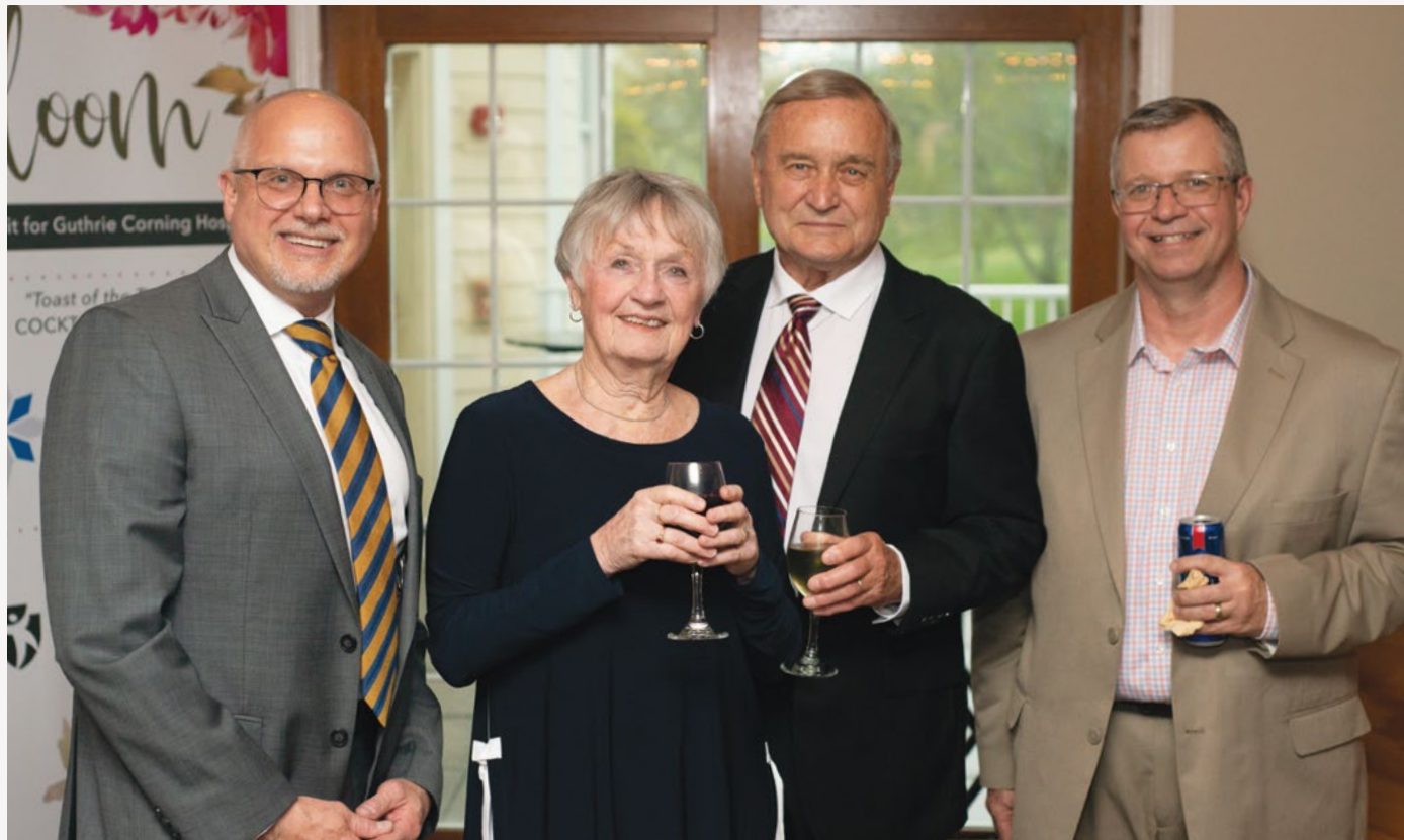
Attendees gather at “Bloom,” honoring a decade of care at Guthrie Corning Hospital.