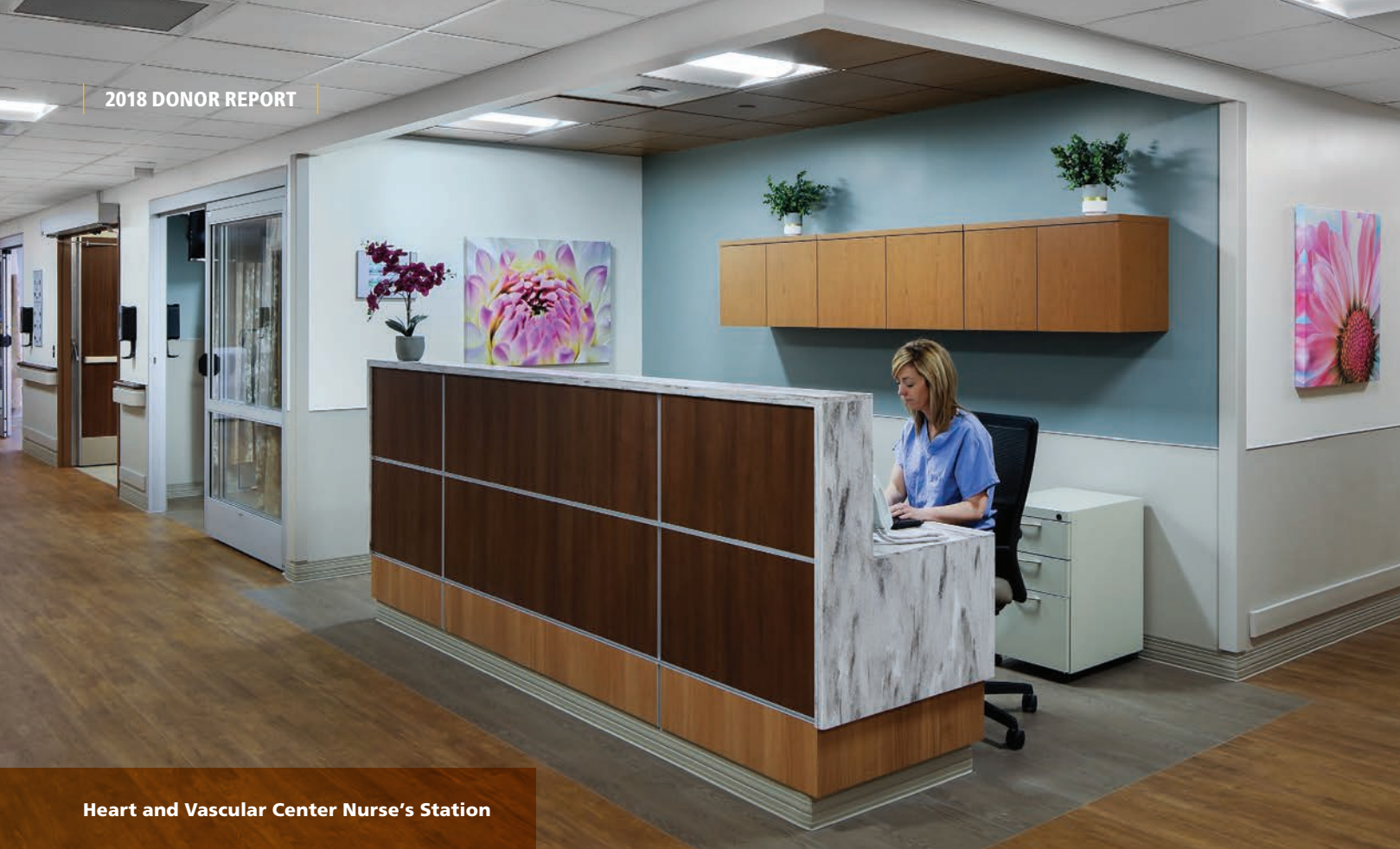
Heart and Vascular Center Nurse's Station