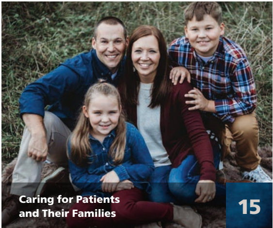
Caring for Patients and Their Families