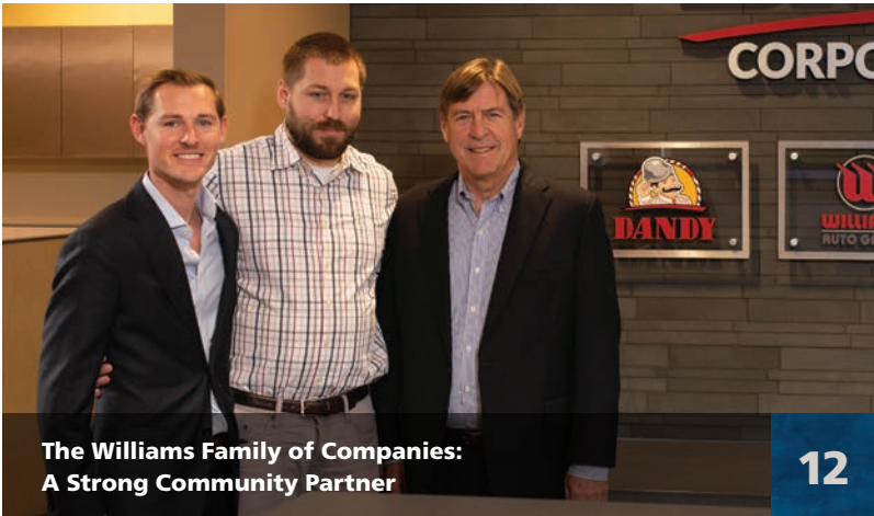
The Williams Family of Companies: A Strong Community Partner