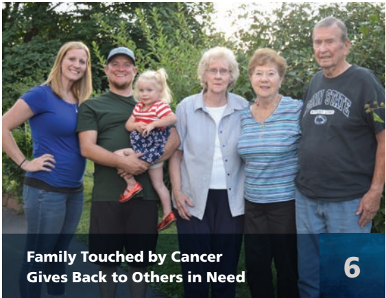
Family Touched by Cancer Gives Back to Others in Need